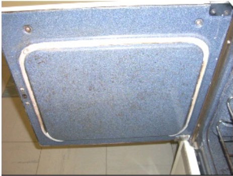
asbestos rope oven.png