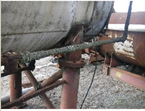
Asbestos Rope P1754 Prensa.JPG