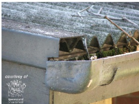
QLD GOVT IMAGE-3.jpg