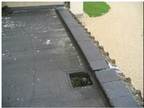
asbestos bitumen roof.jpg