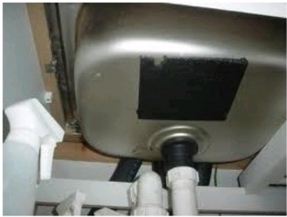
asbestos bitumen undersink.jpg