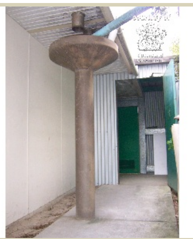
5678 QLD GOVT IMAGE.jpg