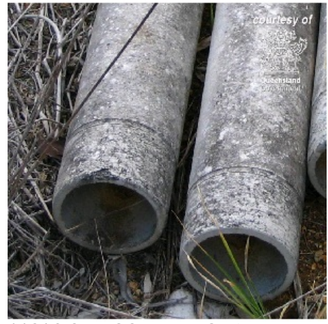
11316 QLD GOVT IMAGE.jpg