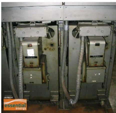
Westinghouse B18 type switchgear_.jpg