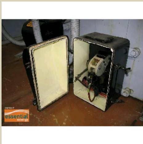
Oil Circuit Breaker Closing Contactors.jpg

Name Oil Circuit Breaker Closing Contactors