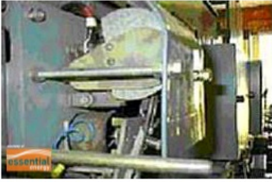
Oil Circuit Breaker Closing Contactors 3.jpg

Name Oil Circuit Breaker Closing Contactors