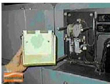
Oil Circuit Breaker Closing Contactors 2.jpg

Name Oil Circuit Breaker Closing Contactors