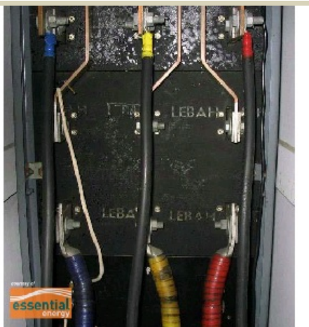
LV Distribution Board.jpg