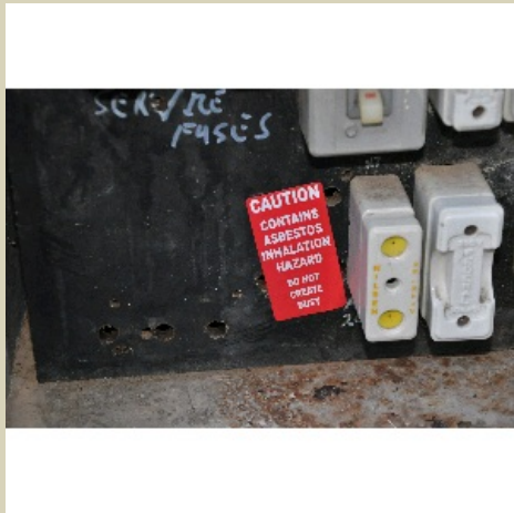
114 Asbestos Power Boards .jpg