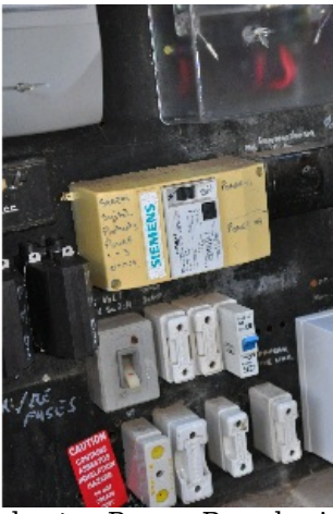
111 Asbestos Power Boards .jpg