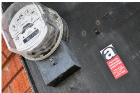
0116 Asbestos Power Boards .jpg