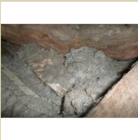
Loose Fill Asbestos 2.jpg