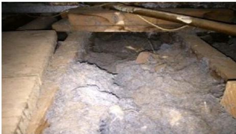
Loose Fill Asbestos.jpg