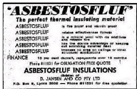
Loose Fill - asbetsos fluf ad.jpg