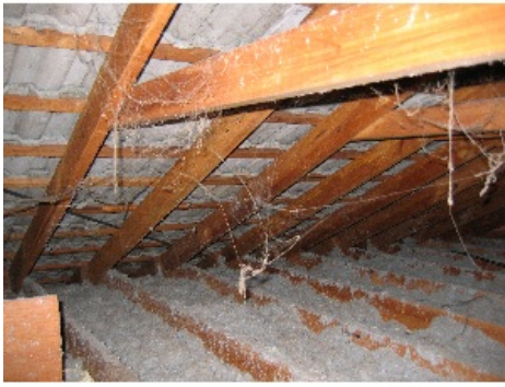
Loose Fill Asbestos_ 006.jpg