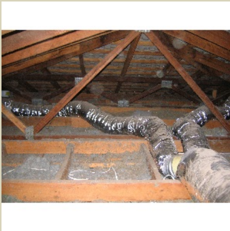
Loose Fill Asbestos_Ph_ 018.jpg