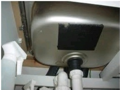
asbestos bitumen undersink.jpg