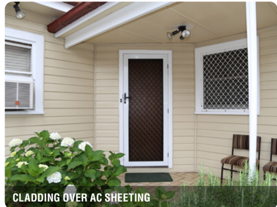
CLADDING OVER AC SHEETING