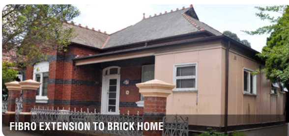
FIBRO EXTENSION TO BRICK HOME