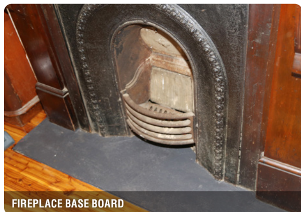
FIREPLACE BASE BOARD