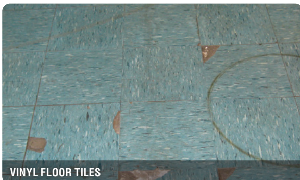
VINYL FLOOR TILES