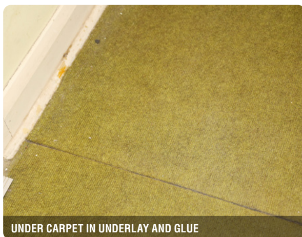
UNDER CARPET IN UNDERLAY AND GLUE