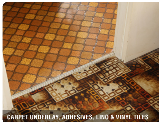
CARPET UNDERLAY, ADHESIVES, LINO & VINYL TILES