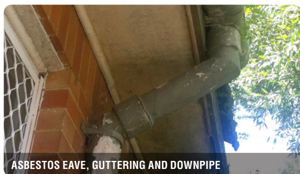
ASBESTOS EAVE, GUTTERING AND DOWNPIPE